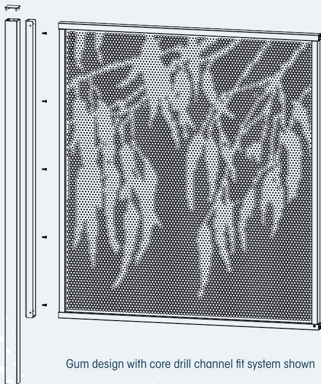
Gum design with core drill channel fit system shown

Pool Perf is the ultimate pool fence system that is built to last made from corrosion resistant marine grade aluminium. The clever design saves you time while installing and cleaning, you just have to hose it off to clean.